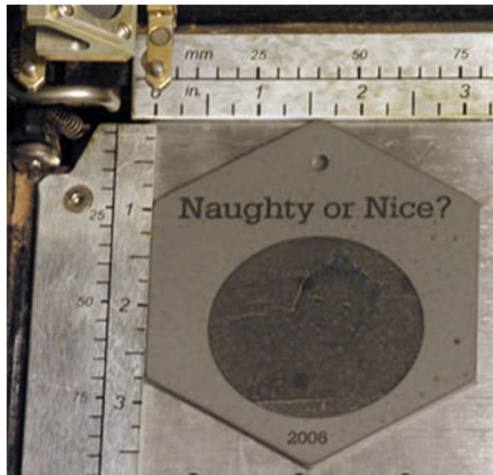
Engraved ornament before cleaning