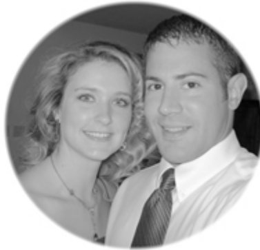
With Tone Curve

Now look at the engraving results that Tone Curve yields: