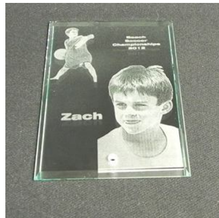
Photo engraved on Mirrored Glass

For more information on how the above were created, visit LaserU's Learning Center and see Course 20 - Glass & Crystal.