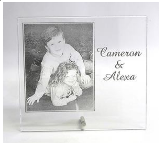
Photo CerMark'ed on Glass