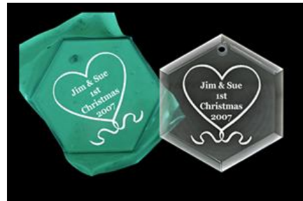
Green masking tape used on crystal