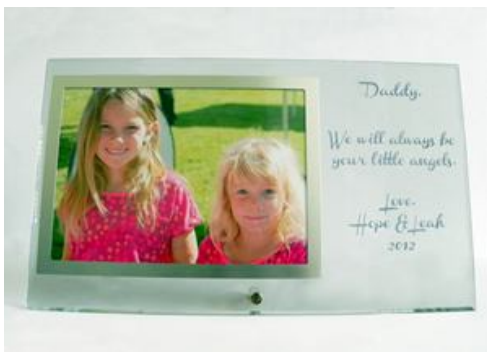
CerMark used on words on glass